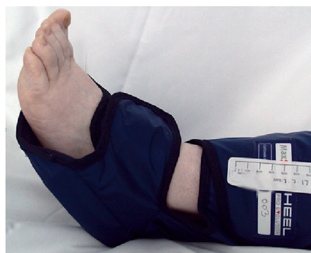
Figure 1. Example of Maxxcare Pro Evolution Heel boot offloading the left foot